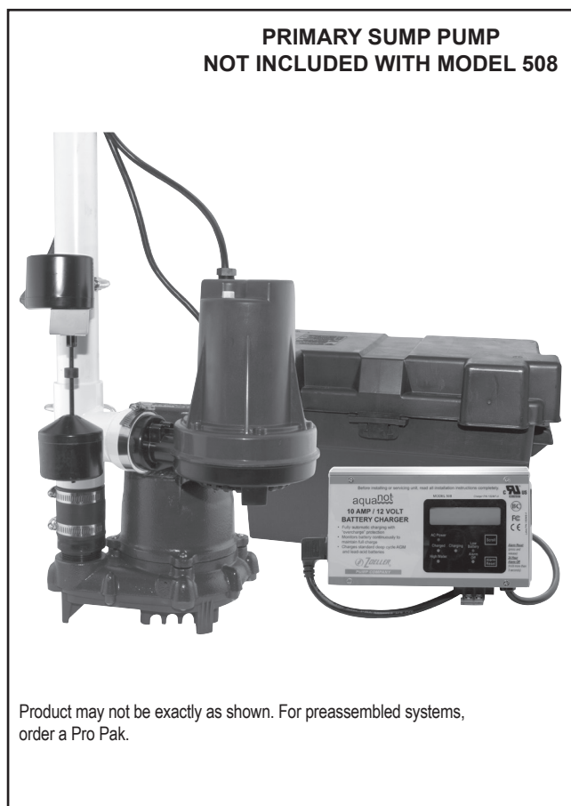
PRIMARY SUMP PUMP NOT INCLUDED WITH MODEL 508

Product may not be exactly as shown. For preassembled systems, order a Pro Pak.