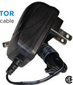
AC ADAPTOR 6-foot cable