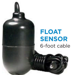
FLOAT SENSOR 6-foot cable