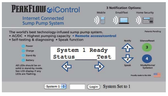
24/7 interface from any Internet connection.