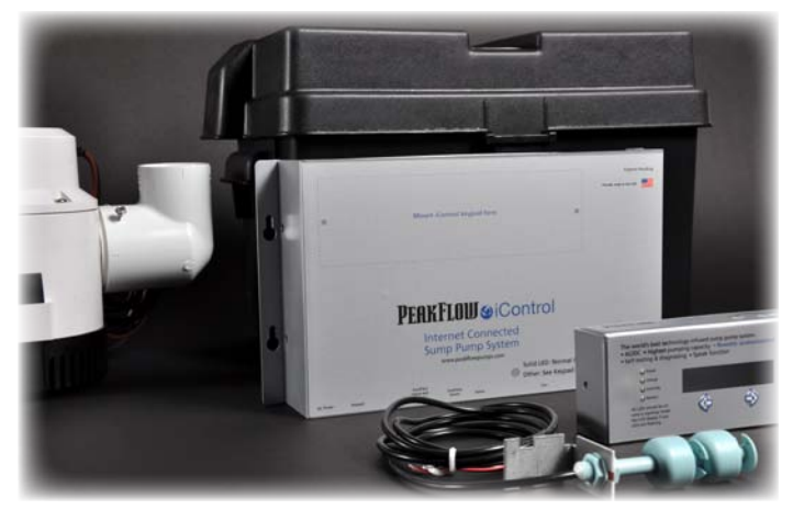
The best flood protection on earth

The iControl is the world's only Internet-connected sump pump system. The DataPump is equivalent to iControl but without Internet capabilities.