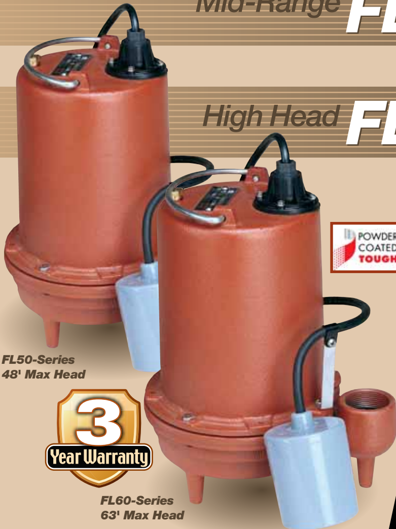
FL50-Series 48' Max Head