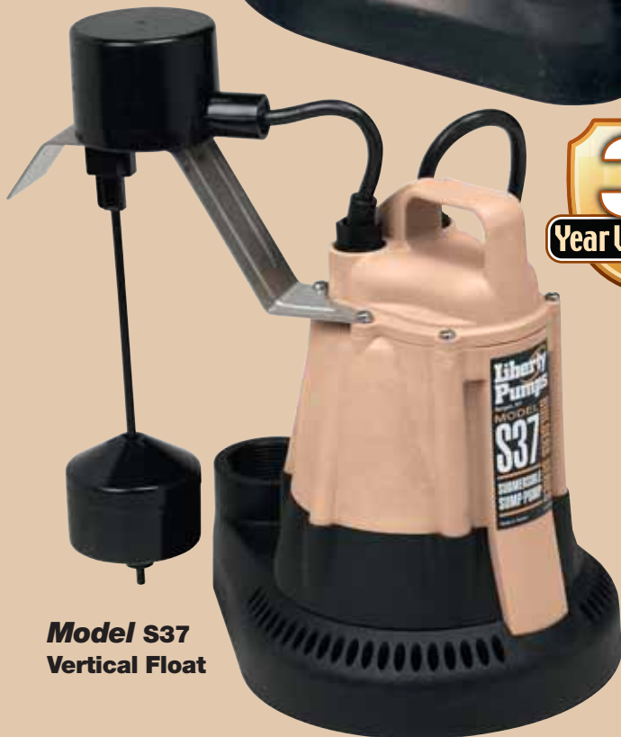
Model S37 Vertical Float