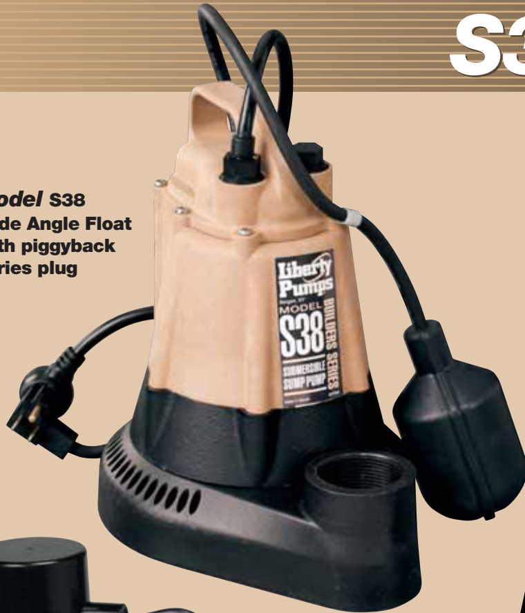
Model S38 Wide Angle Float with piggyback series plug