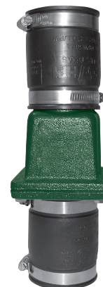
30-0151 Cast Iron