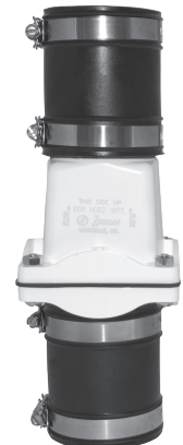
30-0021 Pvc Plastic

Consult Factory or local representative for state approvals