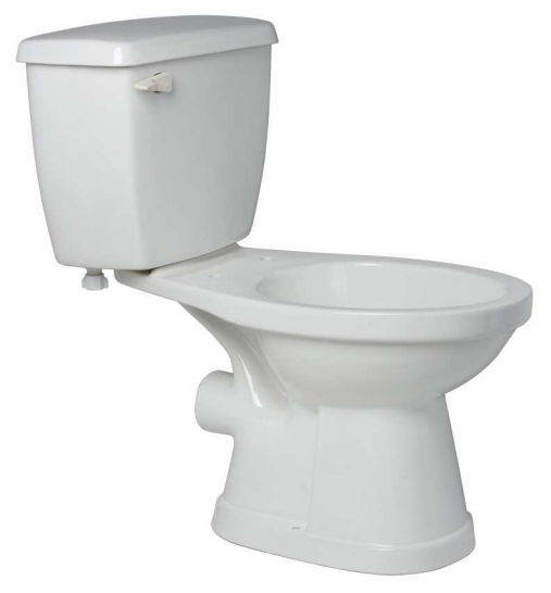
Elongated Bowl with Tank (005 & 007)