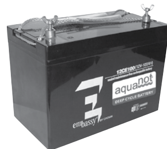
Aquanot® Deep-cycle Battery (purchase separately) P/N 10-1450 - AGM (shown) P/N 10-0761 - Wet