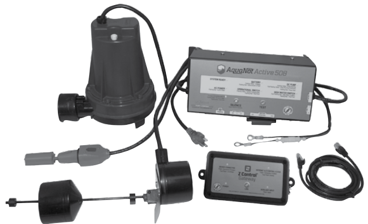
Aquanot® Active 508 system