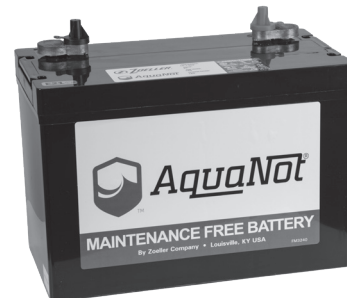
AquaNot® Deep-cycle Battery (purchase separately)