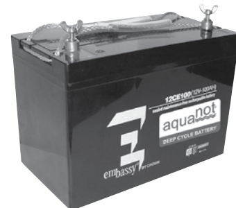
Aquanot® Deep-Cycle Battery (purchase separately) P/N 10-1450 - AGM (shown) P/N 10-0761 - Wet