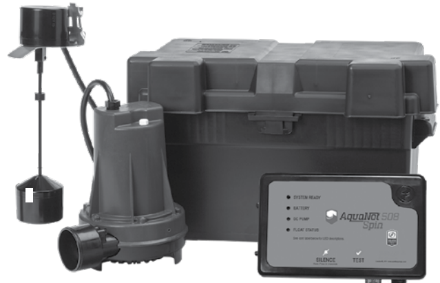
Aquanot® Spin 508 system

* If optional high water reed sensor is being used