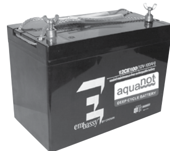
Aquanot® Deep-cycle Battery (purchase separately) P/N 10-1450 - AGM (shown) P/N 10-0761 - Wet